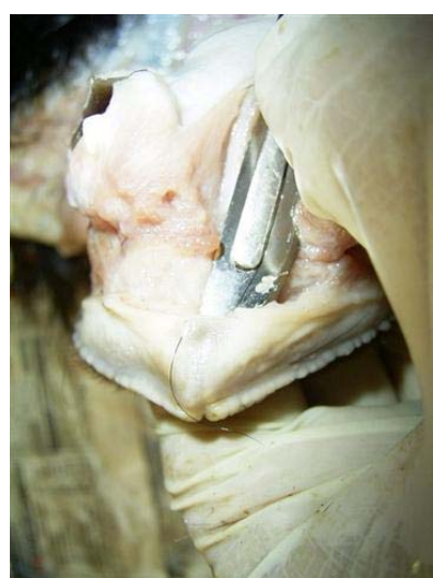
Splitting the lip.

The lips are opened or split by holding the outer surfaces, the hair-side and the textured gum-side, between the thumb and forefinger while cutting on the flesh side with a knife so they will flay open, just as you would butterfly a prawn. Take extreme care to avoid cutting through the narrow lip walls. You are opening the lip line so the salt can preserve it.