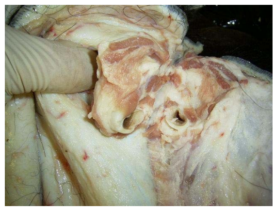
Ear cut off at skull. (Note the small hole).

After all opening cuts are made, skin forward, up and over the shoulders and the neck. As the skin is pulled forward the white connective tissue is all that should be sliced through to remove the hide from the meat of the carcass. This assures there will be no knife nicks in the skin and less meat to remove from the hide during rough fleshing. Skin up over the base of the ears by pulling the skin forward until the creamy-yellowish ear cartilage is seen. Always make sure the muscles of the ear bases, the ear butts, are cut through at their point of attachment right on the skull. You will cut a lot of meat off with them but this can be removed during rough fleshing. Never let the ears be cut further up the ear canal as this will result in a repair fee.