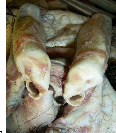
Ear before turning.